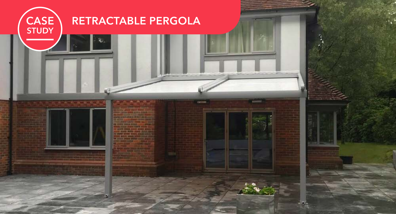
ASCOT PROJECT BERKSHIRE | SUBULATE ULMUS | Retractable Pergola