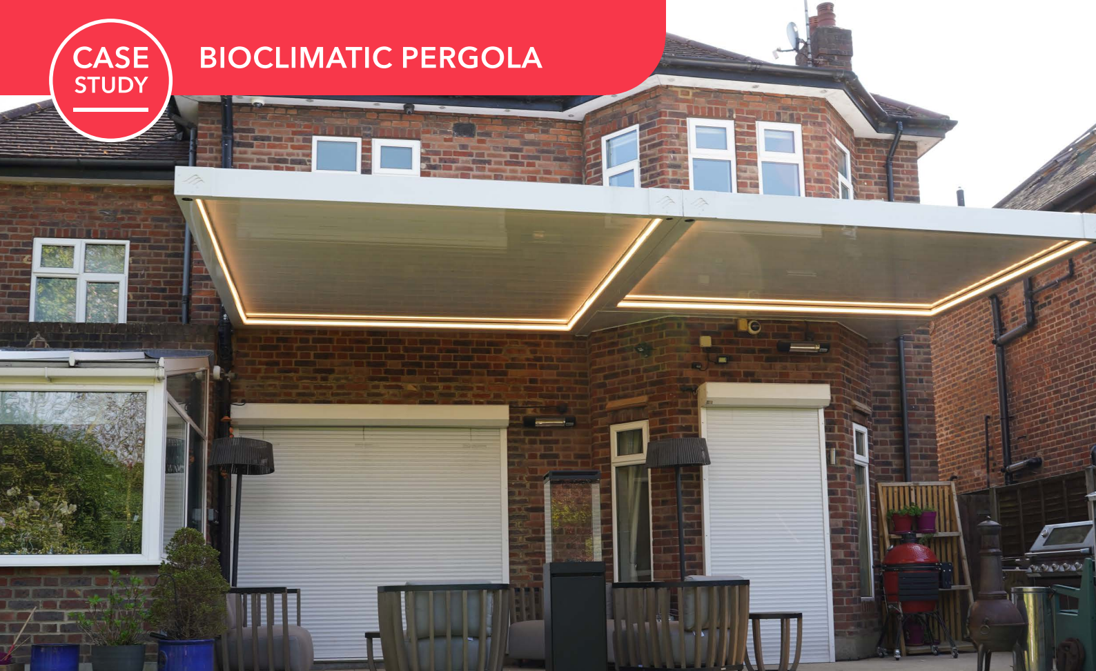
BARNET PROJECT, GREATER LONDON | Zeus Modern | Bioclimatic Pergola