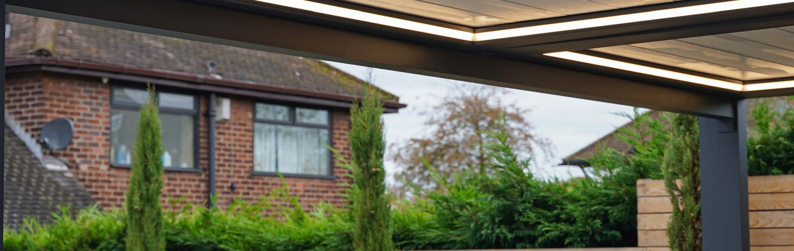
BILLINGE PROJECT, GREATER MANCHESTER | Zeus Independent |