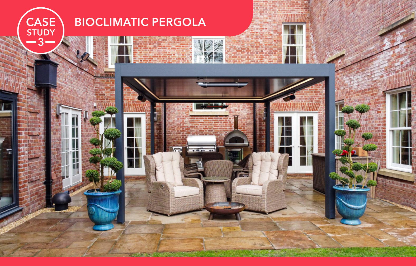
CREWE PROJECT, CHESHIRE | Zeus Independent | Bioclimatic Pergola