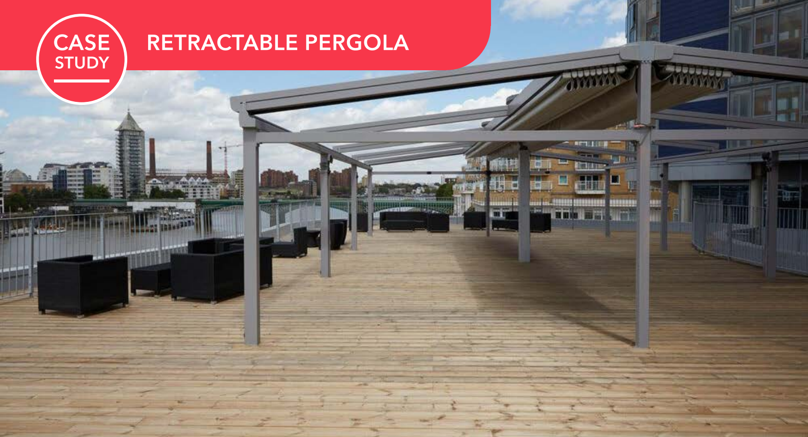
HOTEL RAFAYEL PROJECT LONDON | SUBULATE QUERCUS MINIMA | Retractable Pergolas