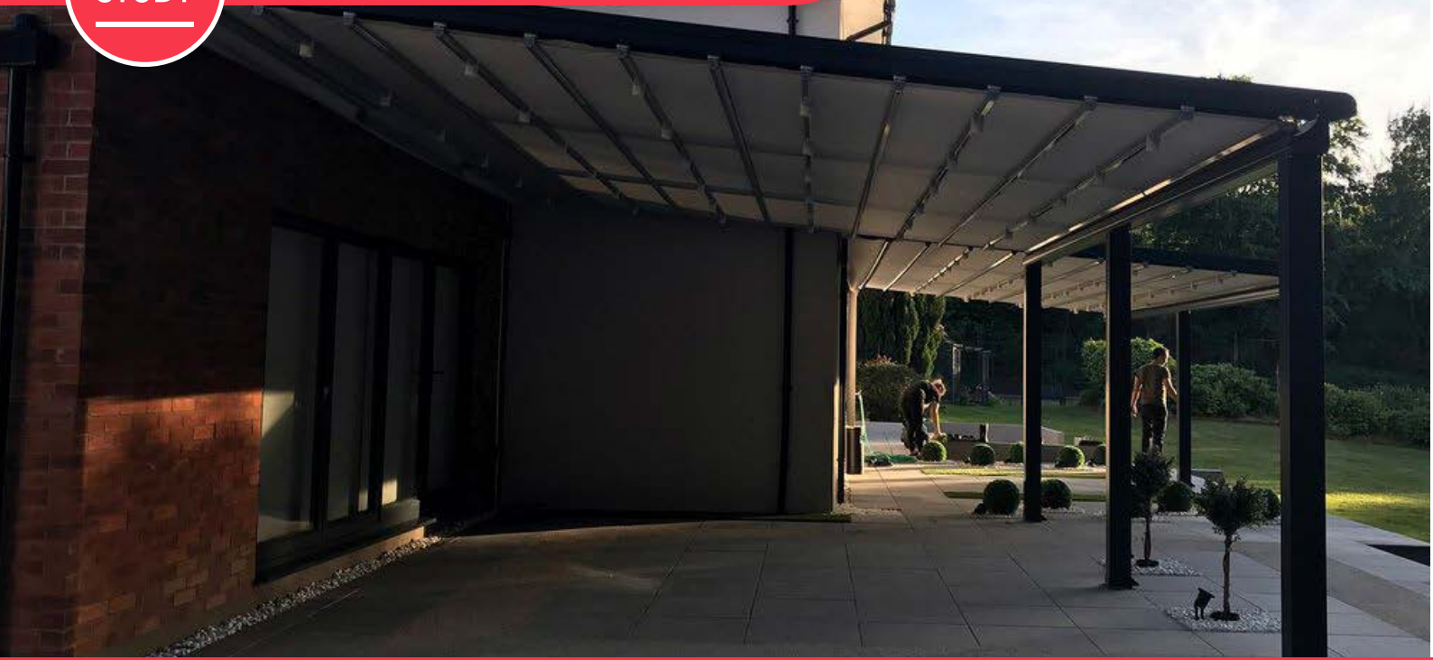
LONDON PROJECT GREATER LONDON | SUBULATE QUERCUS MINIMA | Retractable Pergola