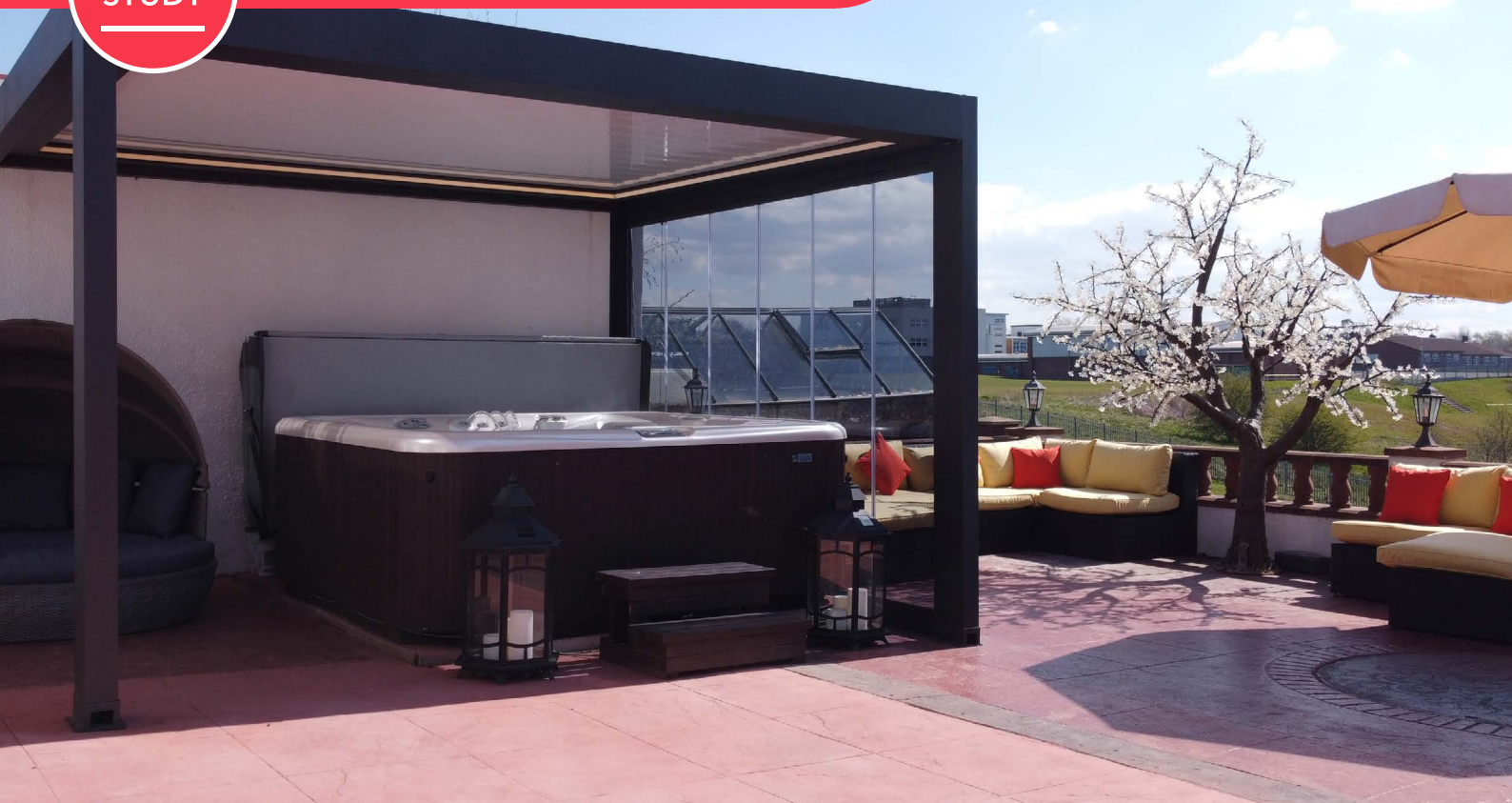
MIDDLETON PROJECT, GREATER MANCHESTER | Zeus Retro | Bioclimatic Pergola