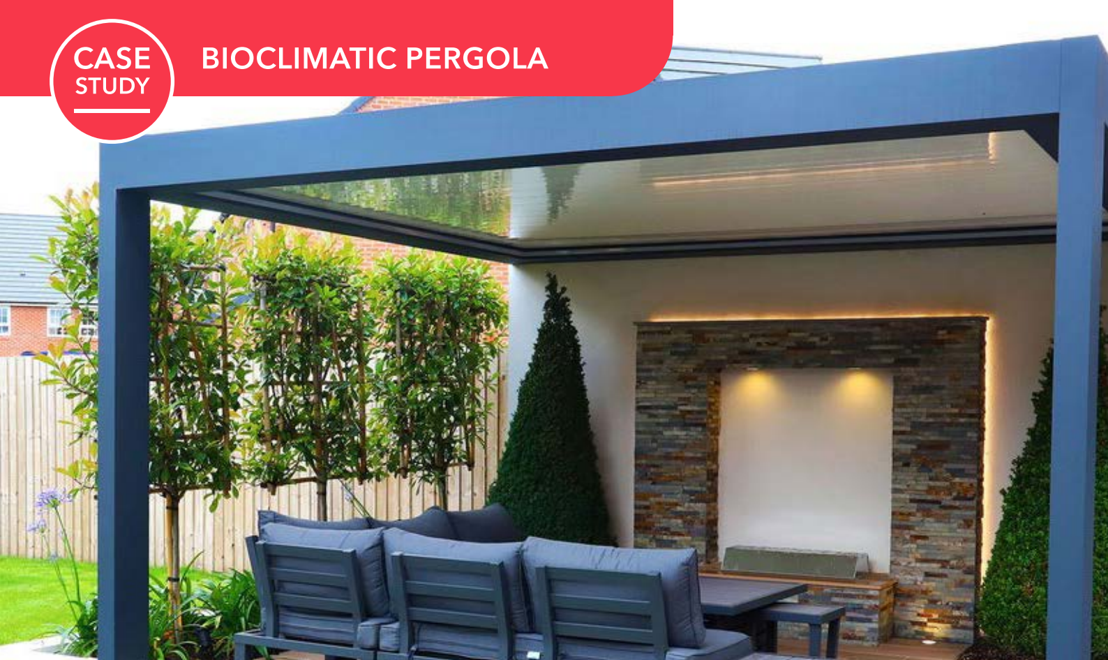
WOOLTON PROJECT LIVERPOOL | Zeus Retro | Bioclimatic Pergola