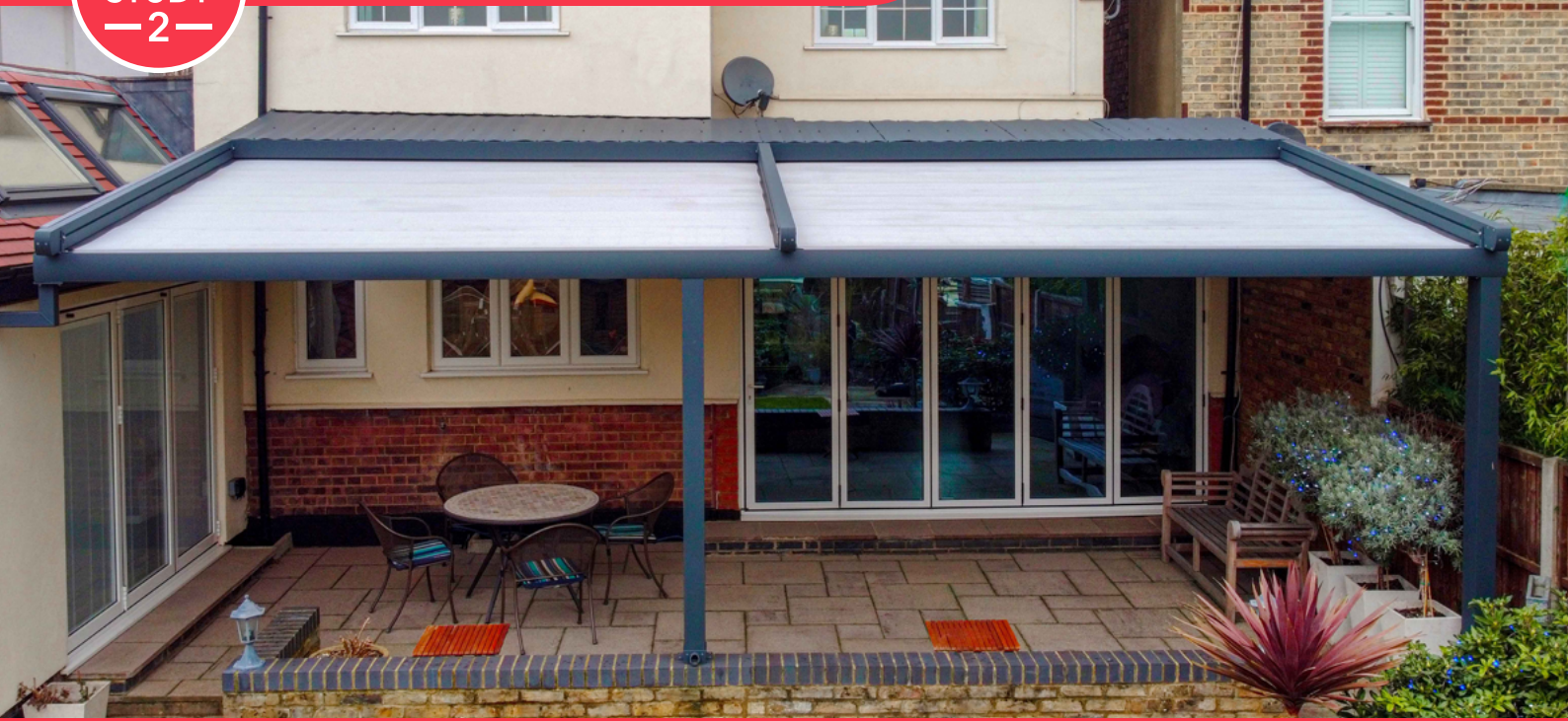
HORNSEY PROJECT, LONDON | SUBULATE QUERCUS MINIMA | Retractable Pergola