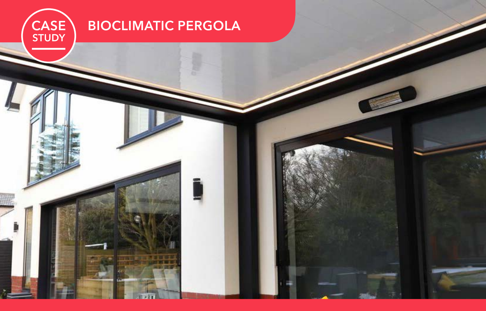
WOOLTON PROJECT LIVERPOOL | Zeus Independent | Bioclimatic Pergola