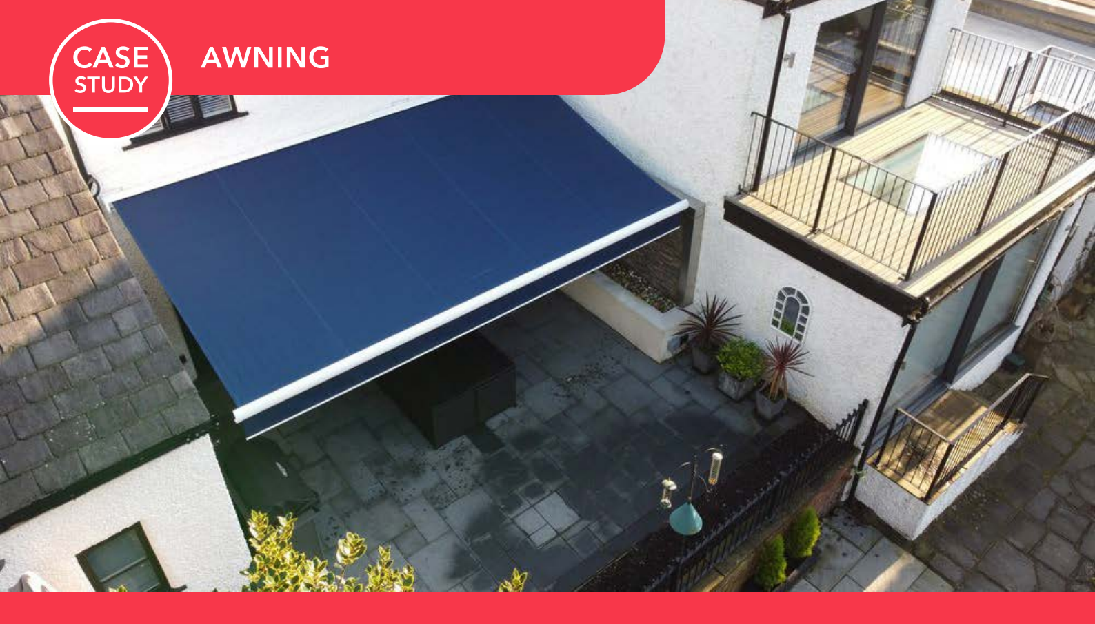
WORSLEY PROJECT, GREATER MANCHESTER | Orion Plus Cassette Awning

On this beautiful project we have installed the masculine system the Pars Plus awning that ticks all the right boxes.