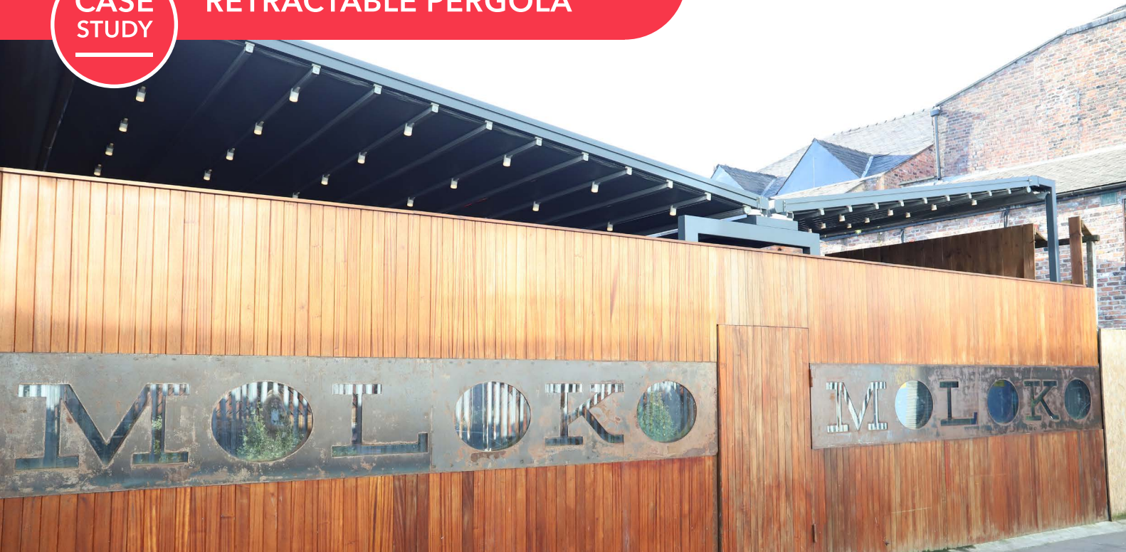
MOLOKO LIVERPOOL PROJECT | 4X SUBULATE QUERCUS MINIMA | Retractable Pergola