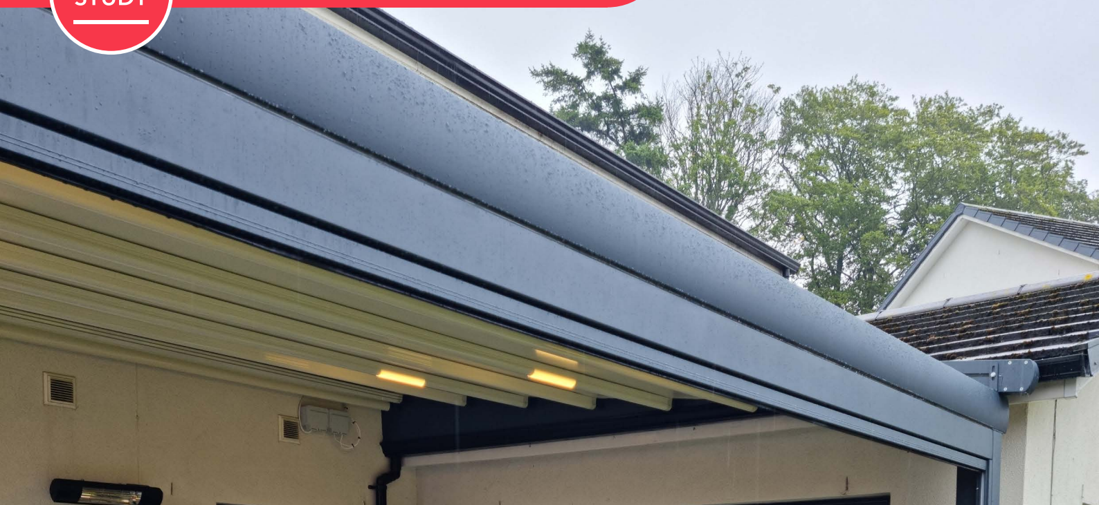
ABERDEEN PROJECT, NORTH EAST SCOTLAND | Subulate Quercus Minima,