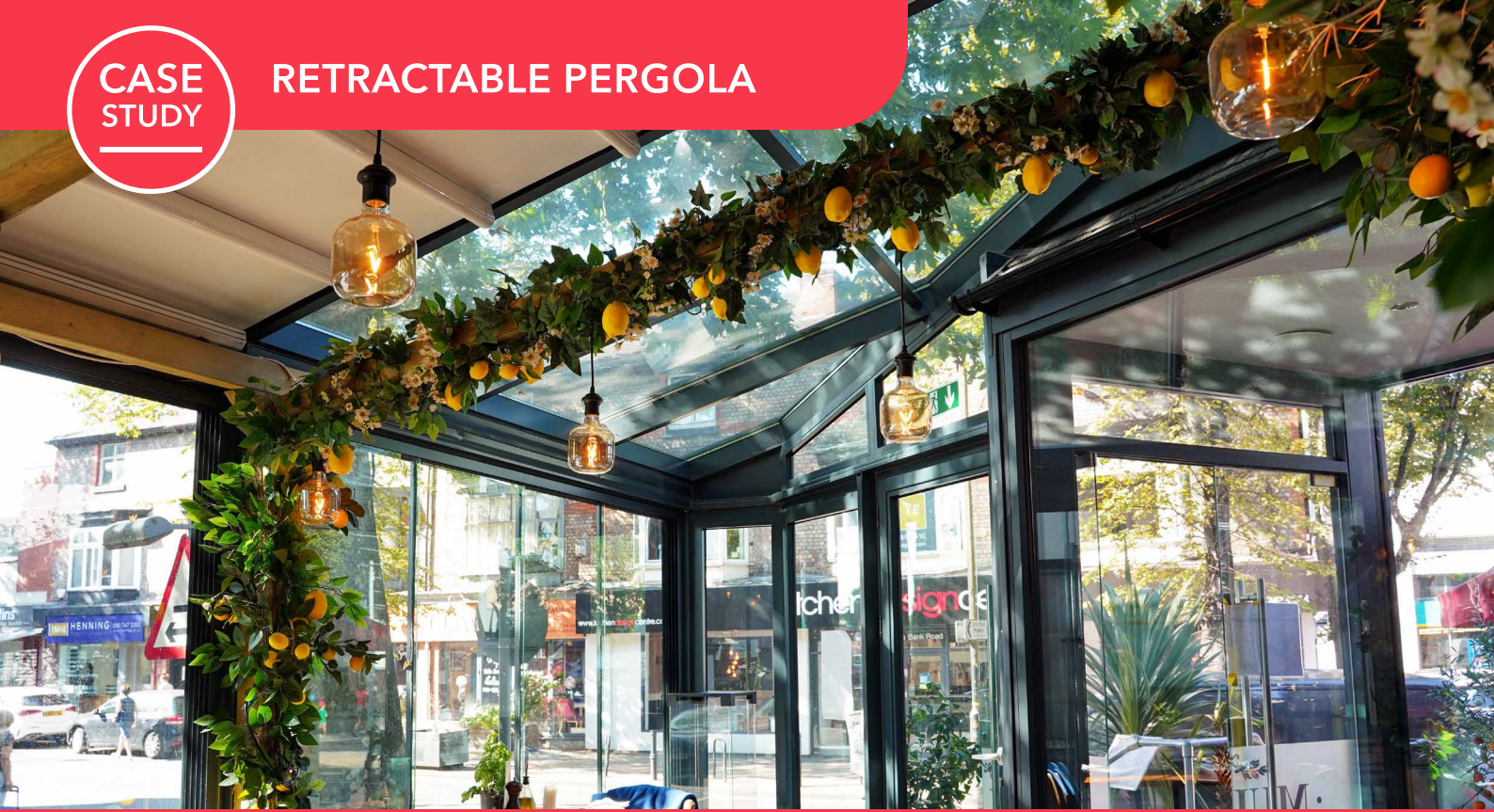
MULINO RESTAURANT, GREATER MANCHESTER | Subulate Quercus Minima,