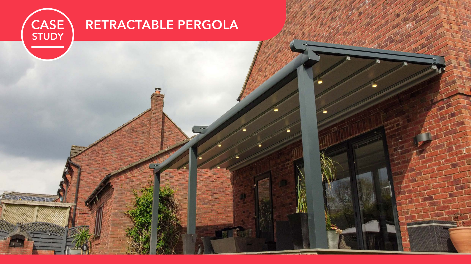
WORSLEY PROJECT, GREATER MANCHESTER | Subulate Quercus Minima | Retractable Pergola