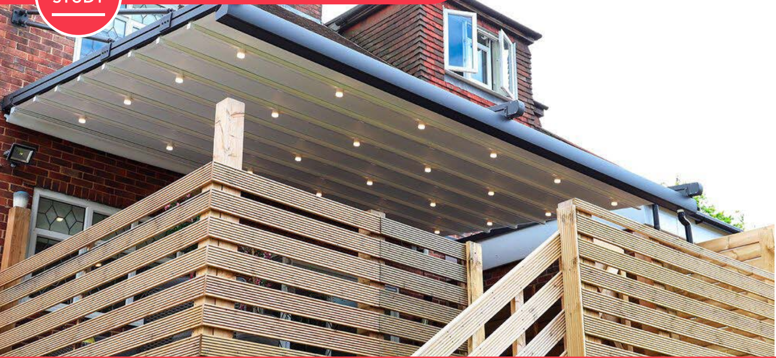
HIGH WYCOMBE PROJECT BUCKINGHAMSHIRE | TAILOR MADE R2 SUBULATE MINIMA | Retractable Pergola