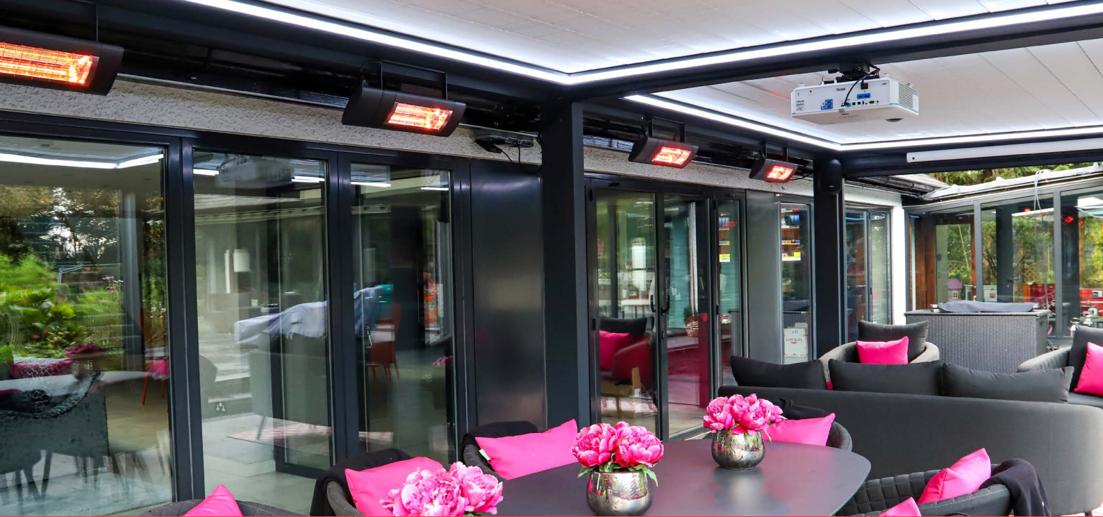
WORSLEY PROJECT, GREATER MANCHESTER | B-CUBE FREEDOM | Bioclimatic